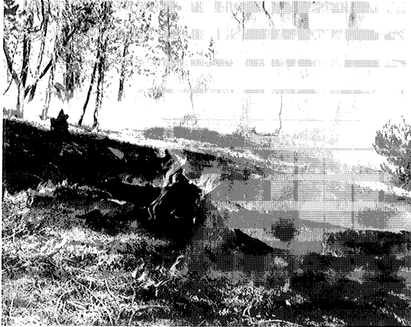
Fig. 4. Fire in the red fir-lodgepole-Jeffrey pine forests of the Sierra reduces ground fuels, recycles nutrients back into the soil, and prepares an ideal seedbed for pine and other sun-loving, fire-dependent species. Because of the frequent surface fires, crown fires are seldom seen here.

conditions and the frequency, intensity, and hence role of fire. Vegetation ranges from the pineland, saw grass, and coastal prairie communities of Everglades and the basket grass and yucca of Carlsbad Caverns; through the ponderosa pine forest of Saguaro National Monument, to the red fir, lodgepole pine, and parts of the mixed-conifer forest of the Sierra Nevada; and the lodgepole pine, Douglas-fir, aspen, and spruce-fir of the Rocky Mountain parks.