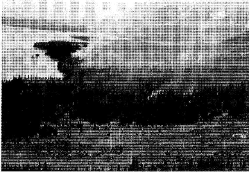
Fig. 1. Public controversy arose at Grand Teton National Park, Wyoming, in 1974 because the slow-burning Waterfall Canyon fire was highly visible across Jackson Lake, and smoke at times obscured the view of the mountains.

“Prescribed burning to achieve approved vegetation and/or wildlife management objectives may be employed as a substitute for natural fire.”