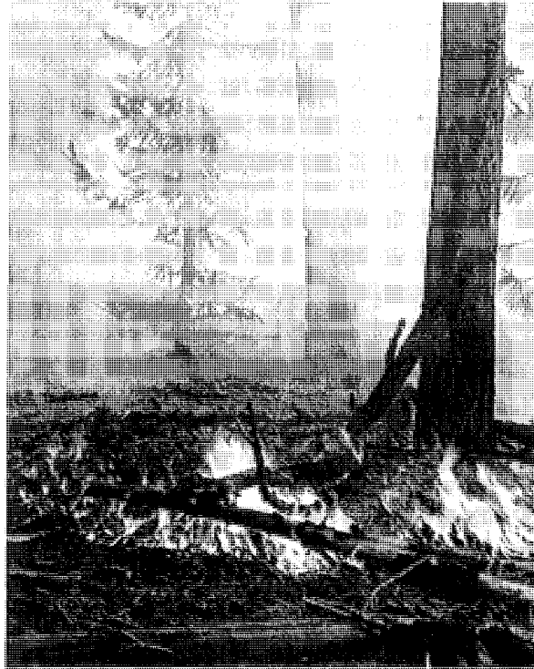
Fig. 3. The 1973 South Sentinel fire in Kings Canyon National Park is typical of the high elevation natural burns in the Sierra Nevada parks of California. Such fires are kept under close observation, but are not automatically suppressed. Most are small and go out before reaching \frac{1}{4} acre in size. More than three million acres in ten national parks are being managed so that fires play a more natural role in the ecosystems.

fuel, vegetation, wildlife, water quality, and soil erosion parameters (Kilgore, 1971).